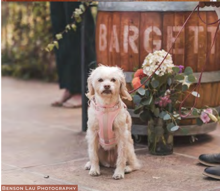
BENSON LAU PHOTOGRAPHY